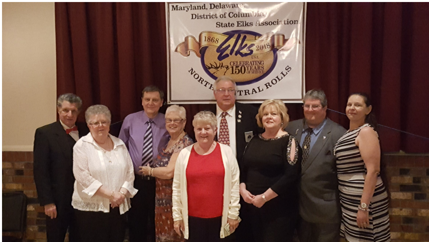
Our Lodge is very well represented at the Maryland, Delaware, District of Columbia State Elks Association. We are very luck to have such great members who are participating at the State level.