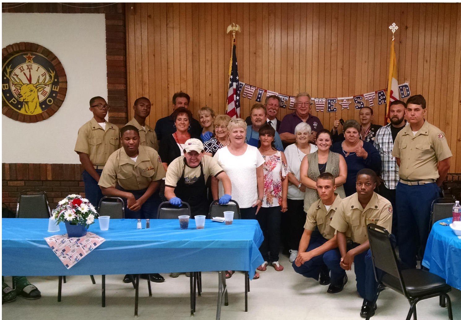
Feed the Vets Luncheon

A Friendly message from the Essex Elks Lodge House Committee & Bartenders.