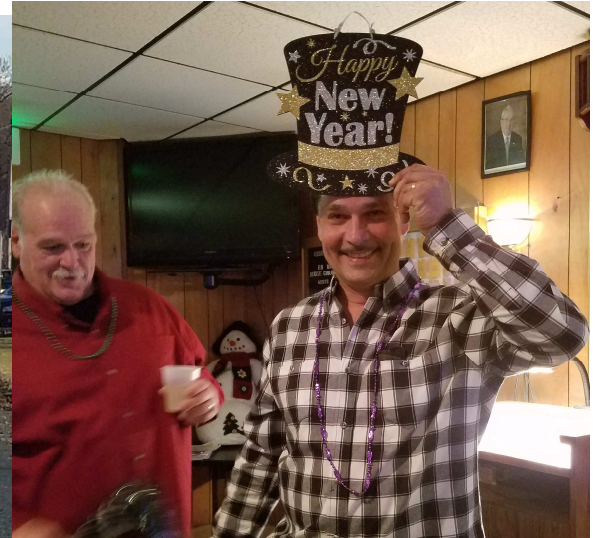
You never know who will be celebrating at the Lodge.